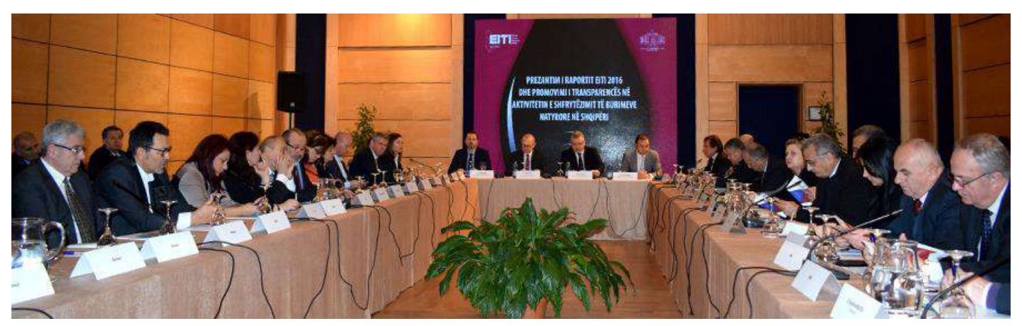
Tirana, 28 February 2018

Representatives from the ASCS participate in the Conference titled "Presentation of EITI 2016 Report and Promotion of Transparency in Natural Resources Exploitation Activity in Albania" organized by the Ministry of Infrastructure and Energy in cooperation with the National Transparency Secretariat for Extractive Industries Alb EITI.