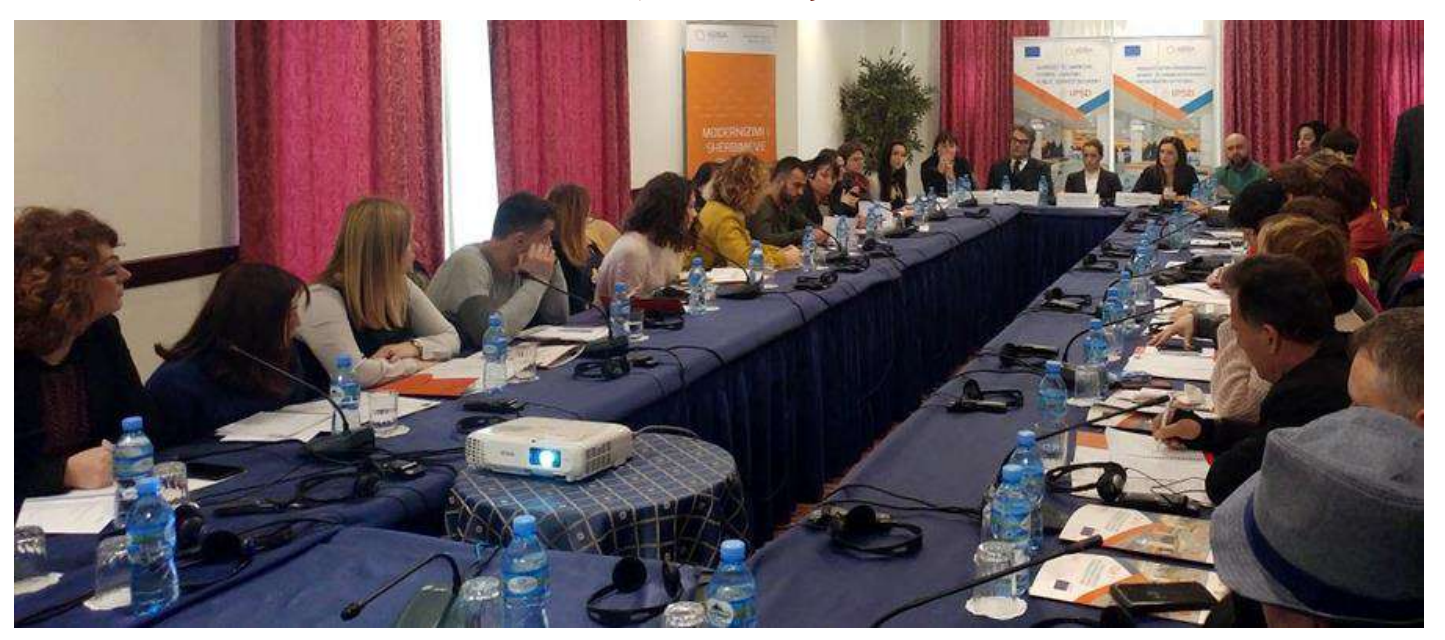
Tirana, 28 February 2018