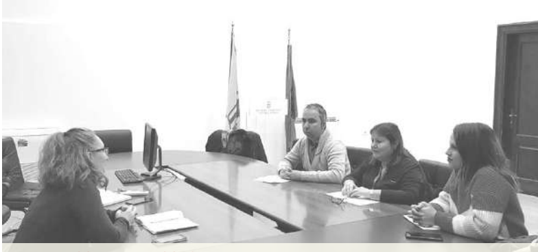
Korça, 23 January 2019 Meeting with representatives of Project Sector – Municipality of Korça