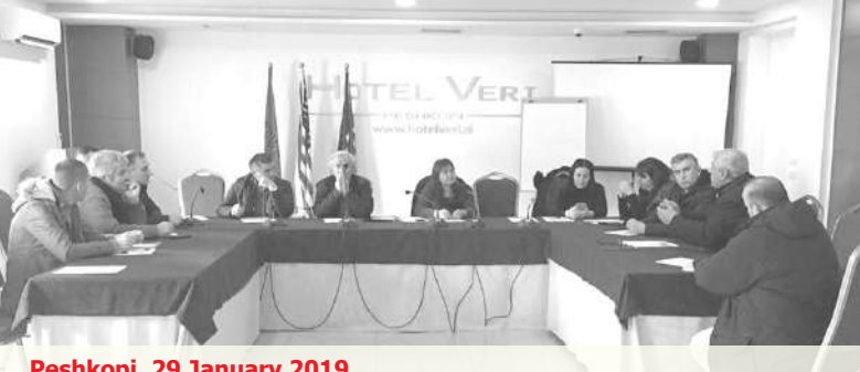
Peshkopi, 29 January 2019 Meeting with Civil Society Organizations in Peshkopi