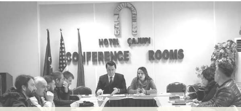
Gjirokastra, 25 January 2019 Meeting with Civil Society Organizations in Gjirokastra