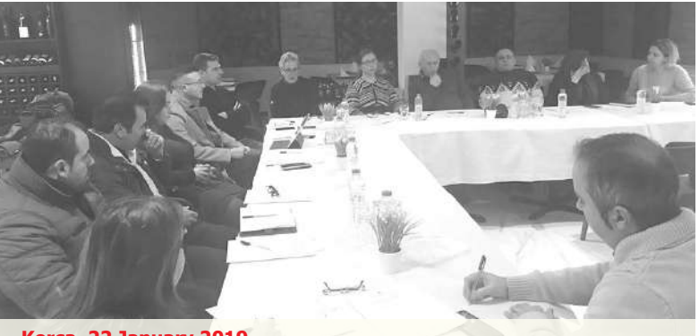
Korça, 22 January 2019 Meeting with Civil Society Organizations in Korça