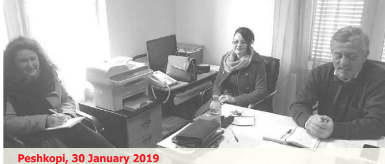
Peshkopi, 30 January 2019 Meeting with Deputy Mayor of Dibër